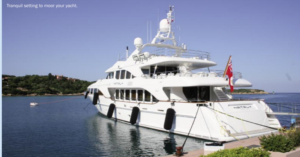
Tranquil setting to moor your yacht.

"I truly believe that travel is just as much about the people as the place and we found a real sense of kindness and serenity about the people of Sardinia."