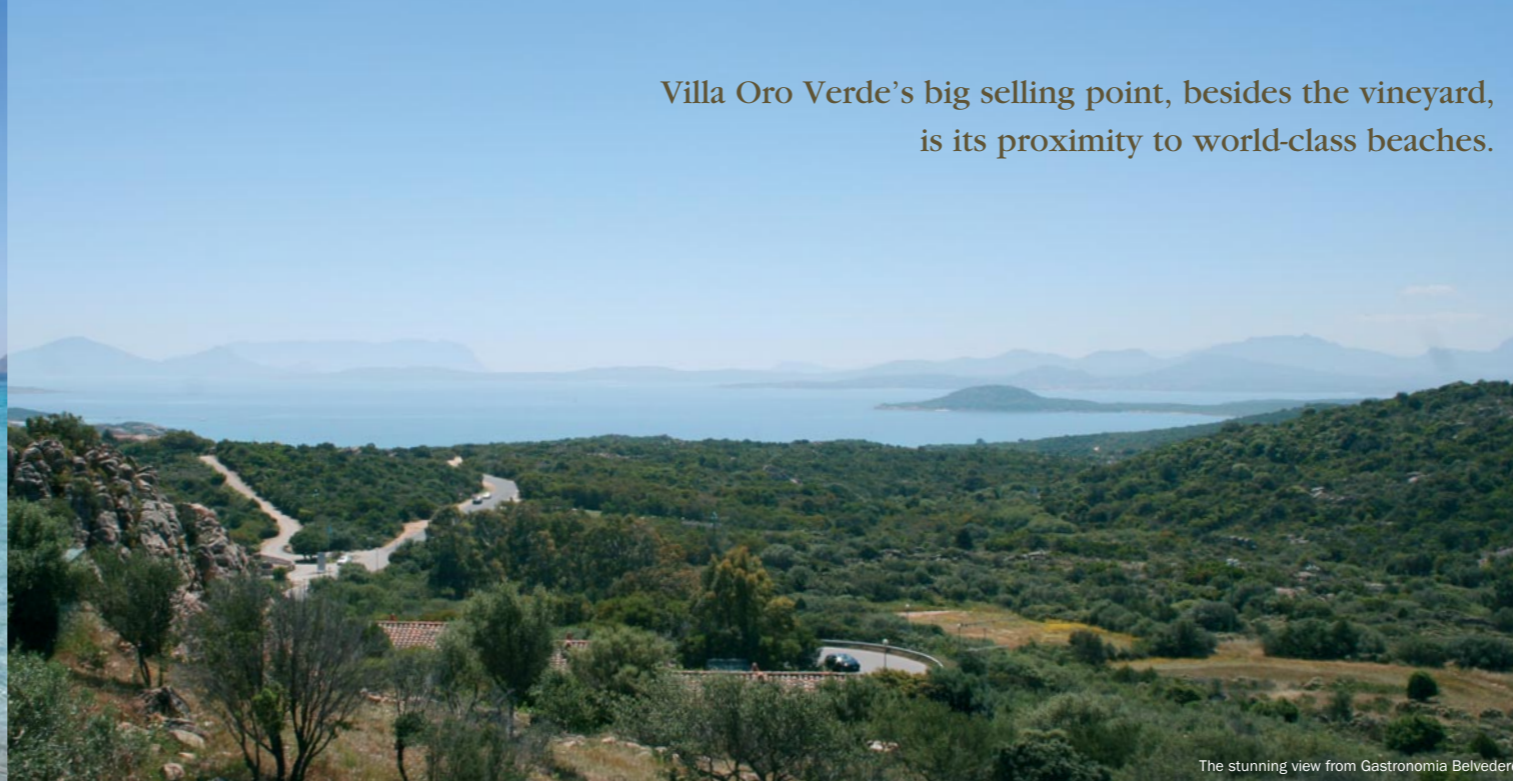
The stunning view from Gastronomìa Belvedere

Villa Oro Verde's big selling point, besides the vineyard, is its proximity to world-class beaches.