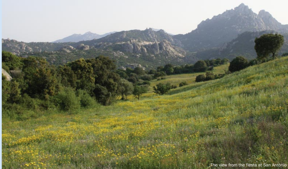
The view from the fiesta at San Antonio

We didn't want to leave our lovely villa or indeed the beautiful island of Sardinia. We had never seen such stunning landscapes or more sparkling, inviting waters. However, I truly believe that travel is just as much about the people as the place and we found a real sense of kindness and serenity about the people of Sardinia. We will definitely return.