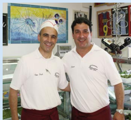
Owners of Gastronomìa Belvedere served the best pasta ever!

To enquire about a holiday to Sardinia please contact Sardinian Places Reservations 0845 330 2050 holidays@sardinianplaces.co.uk www.sardinianplaces.co.uk